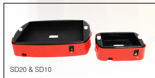
SD20 & SD10